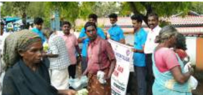
NSS volunteers distributed Food to the needy people in Marthandam Bus Stand and Vettuvenni on 17-10-2022 to celebrate World Food Day.