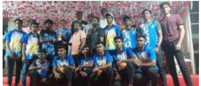
Cross Country Race (10 KM) Men Team won the first place in the M.S. University Inter-Collegiate Tournament on 31-10-2022.