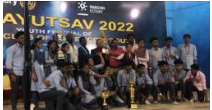
Our students won overall championship in Rotayutsav-'22 conducted by the Rotary Club of Nagercoil on 26-10-2022.