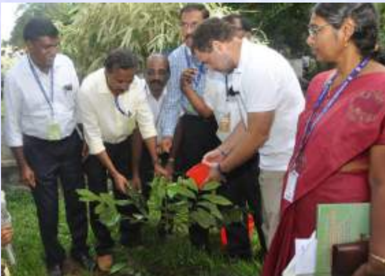
Shri. Rahul Gandhi, M.P., planted a tree sapling ( Myristica fragrans ) in our college campus and resumed the 'Bharat Jodo Yatra' on 10-09-2022.