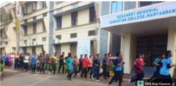
'Fit Indian Freedom Run Campaign' was conducted by NCC on 31-10-2022.