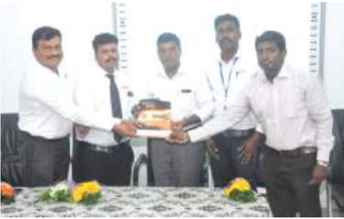
MoU was signed between NMCC and CADD CENTER for Python Certification Programme 2022-23 on 31-10-2022.