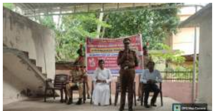
An Awareness Programme was conducted by NCC on "Elimination of Single use Plastics" at Manakuntu village on 04-07-2022.