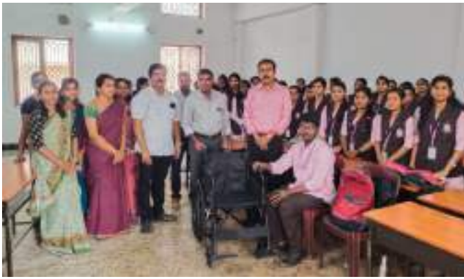
A wheel chair was donated to a physically challenged student of I M.A. English by the students and staff of PG Department of English on 11-11-2022.