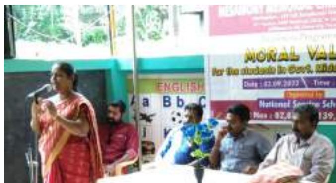
An Awareness programme on "Moral Values", was organized at Govt. Middle school, Perai on 02-09-2022.