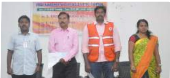
Seminar on Stress Management and Life Skills for YRC Volunteers was held on 27-09-2022.