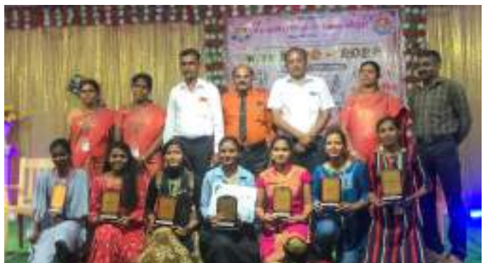
Students of Youth Welfare got I Place in Group Dance Competition conducted at TDNMS College on 28-10-2022.